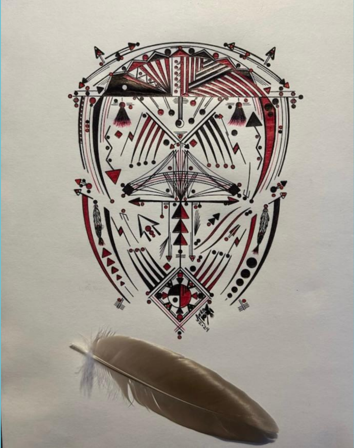
3 rd place contemporary